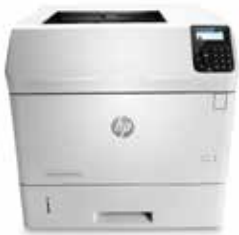
HP LaserJet Enterprise M604n

Keep business moving and produce outstanding print quality. Tackle large jobs and equip workgroups for success—wherever business leads. 2 Easily manage and expand this fast, versatile printer—and help reduce environmental impact.