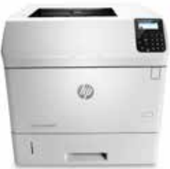
HP LaserJet Enterprise M604dn