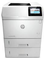
HP LaserJet Enterprise M605x