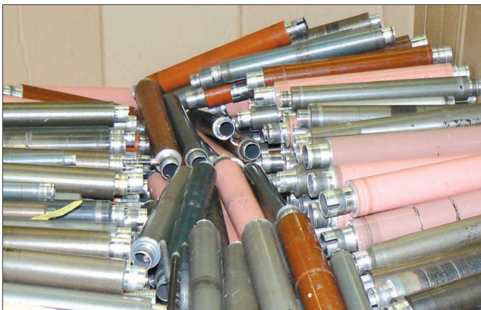
Metrofuser recycles whatever it can't reuse, like these aluminum rollers.